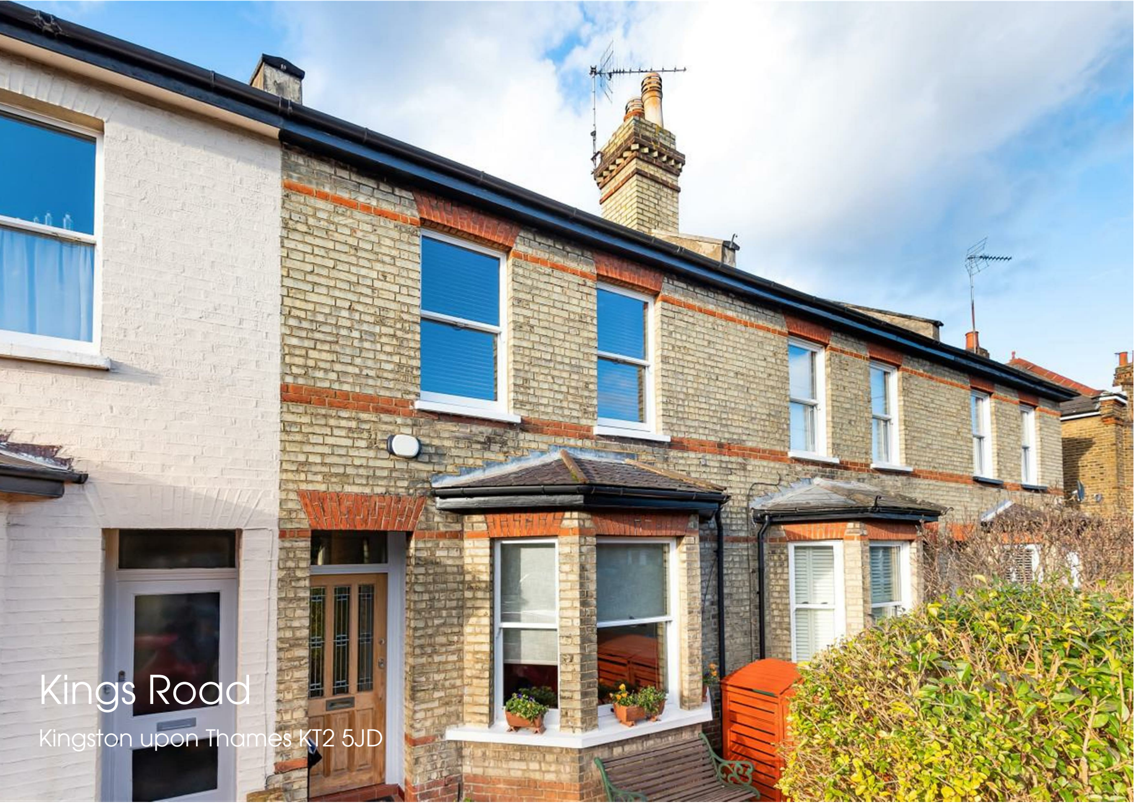
Kings Road Kingston upon Thames KT2 5JD